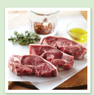
Lamb leg steaks