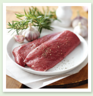
Lamb backstrap (shortloin)

The following cuts also work well in this recipe.