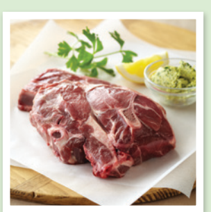
Lamb shoulder chops

The following cuts also work well in this recipe.