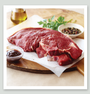
Beef rump steak