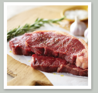
Beef sirloin steak