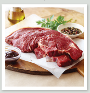
Beef rump steak

The following cuts also work well in this recipe.