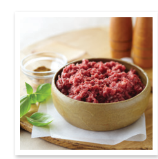
Lamb or beef mince

The following cuts work well in this recipe.