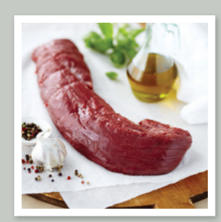
Beef eye fillet

The following cuts also work well in this recipe.