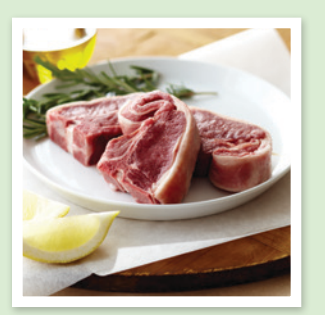
Lamb loin chops

The following cuts also work well in this recipe.