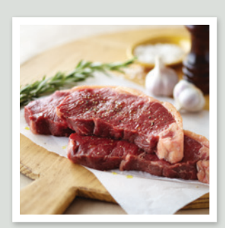
Beef sirloin steak

The following cuts also work well in this recipe.