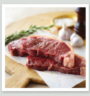
Beef sirloin steak