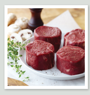
Beef eye fillet steaks