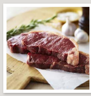
Beef sirloin steak

The following cut also works well in this recipe.