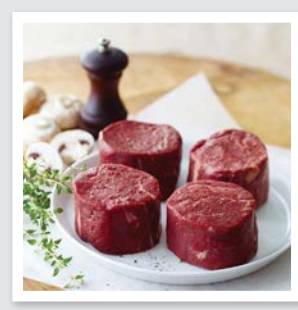
Beef fillet steak