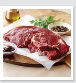
Beef rump steak

The following cuts also work well in this recipe.