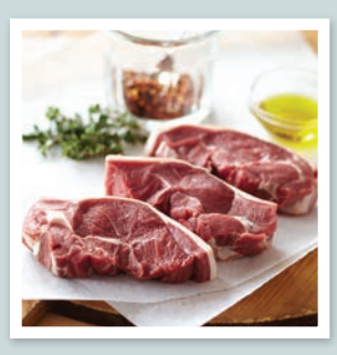
Lamb leg steaks

The following cuts also work well in this recipe.