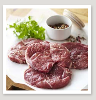
Lamb schnitzel (cut from the lamb rump)

The following cut also works well in this recipe.