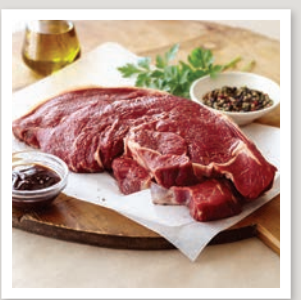
Beef rump steak

The following cut also works well in this recipe.