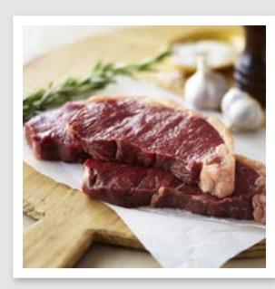
Beef sirloin steak

The following cuts also work well in this recipe.