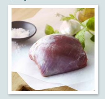
Lamb thick flank

The following cuts also work well in this recipe.