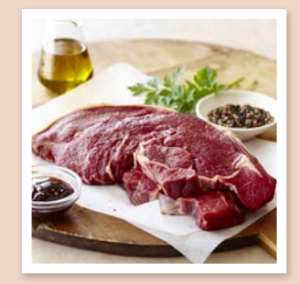
Beef rump steaks

The following cuts also work well in this recipe.