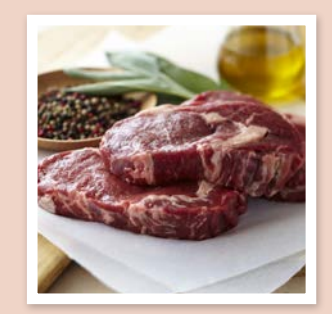
Beef scotch steaks