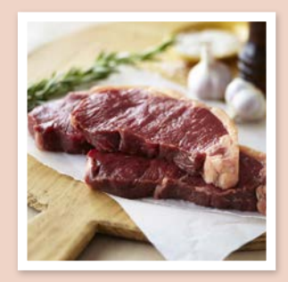
Beef sirloin steaks

The following cuts also work well in this recipe.