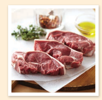
Lamb leg steaks

The following cuts also work well in this recipe.