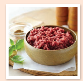
Beef or lamb mince