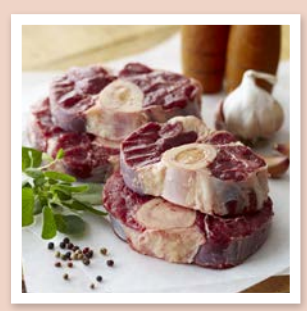
Beef shin on the bone

The following cut also works well in this recipe.