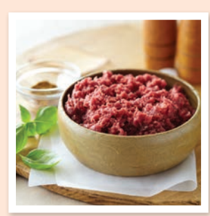
Lamb or beef mince