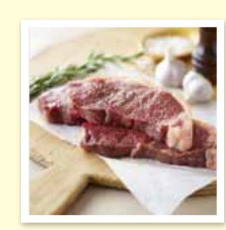
Beef sirloin steak