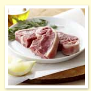
Lamb loin chops