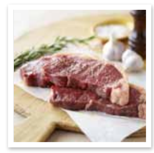
Beef sirloin steak