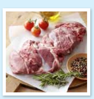
Butterfly lamb leg