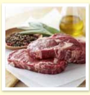
Beef scotch fillet steak