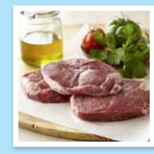
Lamb leg steak