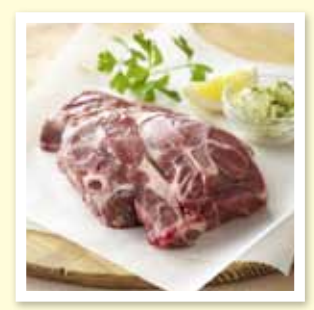
Lamb shoulder chops