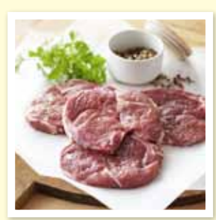
I amh schnitzel

The following cuts work well in this recipe.