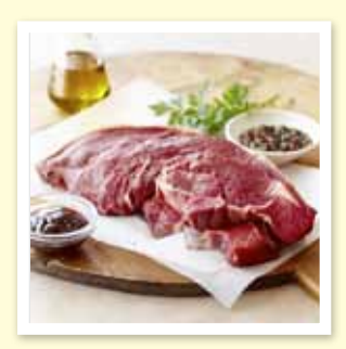
Beef rump steak

The following cuts work well in this recipe.