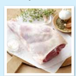
Whole lamb leg

The following cuts work well in this recipe. See recipes.co.nz for cooking times.