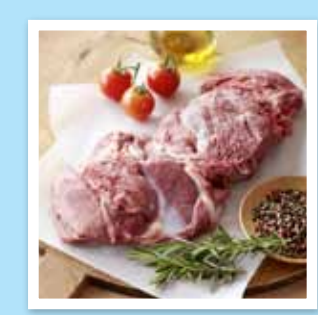
Butterflied lamb leg